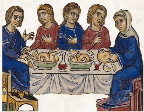
'Arsenal Bible', Paris, Bibl. de l'Arsenal, MS 5211, fol. 364v

Aviva and Sammy Ofer Observation Gallery, 30th Floor, Eshkol Tower