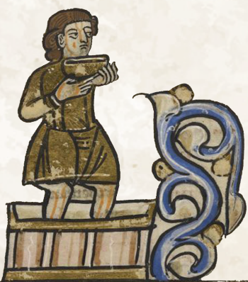
'Psalter of Lambert le Bègue', British Library, Add MS 21114, fol. 5v