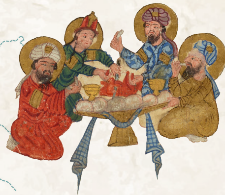
'Maqamat al-Hariri', Paris, Bibl. Nat., Ar 5847, fol. 149r